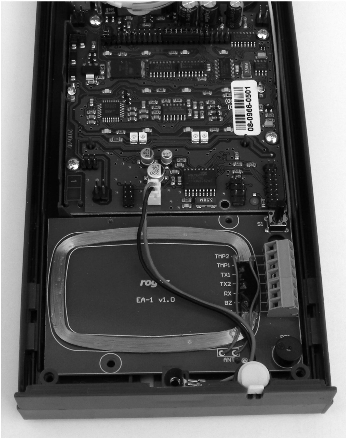
Fig.2 Installation of EA-1 module in HELIOS entryphone